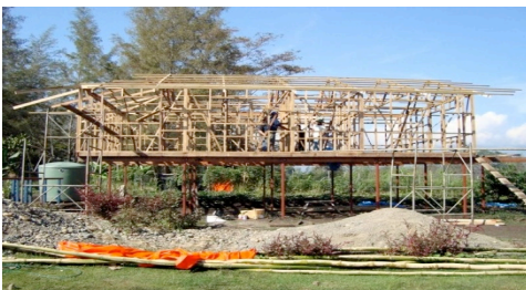
New Staff 3 bedroom house close to completion.