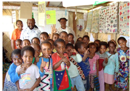
Children at the local elementary school where students teach bible-in-schools.